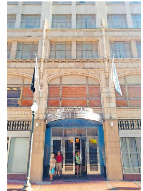
The Pere Marquette Building has a modernized gothic facade.

Architects, for their part, jettisoned Victorian gaudiness and opted for simplicity over detail, openness over clutter, function over form, and new materials like steel frames and sheet glass. The most prominent American architect advancing this new design thinking, Frank Lloyd Wright, did some of his most influential work in this turn-of-the-century era.