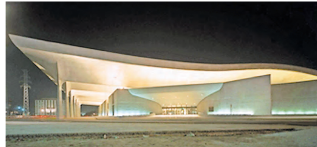
The Rivergate Exhibition Hall