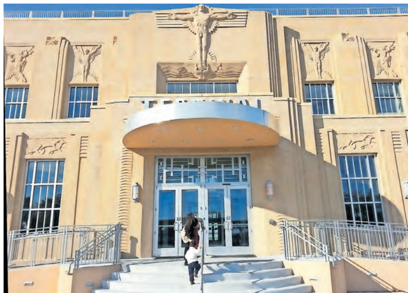
The New Orleans Lakefront Airport Terminal was built in 1934. Richard Campanella

Such cutting-edge designs were a bit too much for most Americans in the 1920s, who were hardly Modernists but nonetheless open to modern thinking. For homeowners, this meant the clean, simple